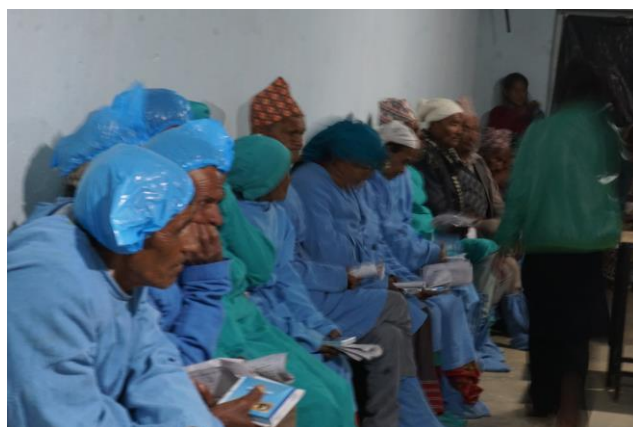
Waiting for the operation.