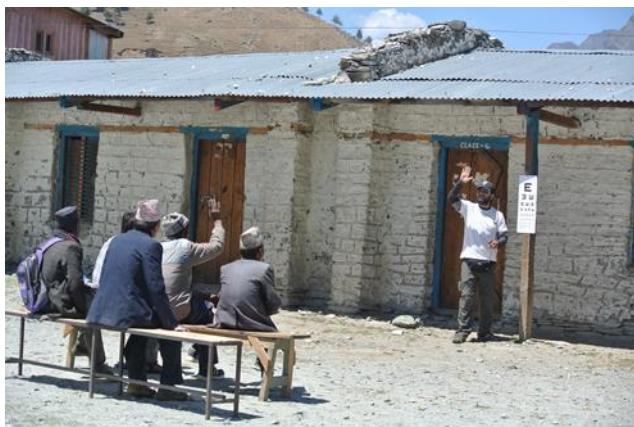
Outdoor assessment of visual acuity.

Zurich, July 2021, the AACZ expedition team